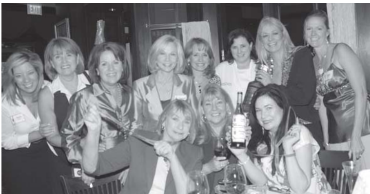
"Girls just want to have fun!"